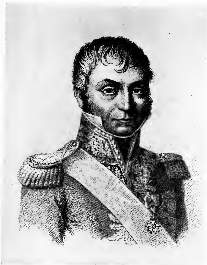
JEAN BAPTISTE JOURDAN AFTER A DRAWING BY AMBROISE TARDIEU